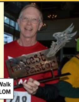
Fastest Pastor Grand Champion — Walk Team SHALOM

Congratulations to our Fastest Pastors and everyone who sponsored, participated and volunteered this year!